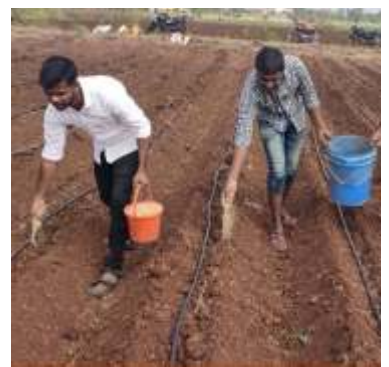
Course NO. AEL AGRO - 4813 Title: Varietal seed production of wheat and their processing