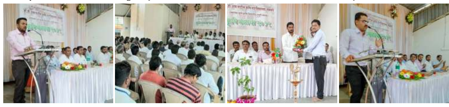
2. Glimpses of Krishi Melava in Nave Pargaon (No. of stalls - 26; No. of farmers - 249; No. of students - 70)