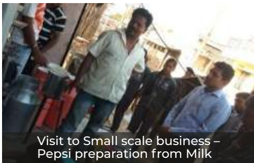
Visit to Small scale business – Pepsi preparation from Milk