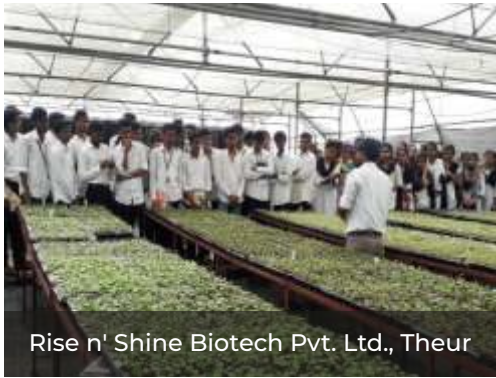
Rise n' Shine Biotech Pvt. Ltd., Theur