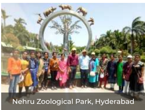
Nehru Zoological Park, Hyderabad