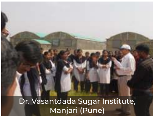
Dr. Vasantdada Sugar Institute, Manjari (Pune)