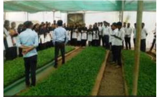
Seema Biotech, Talsande