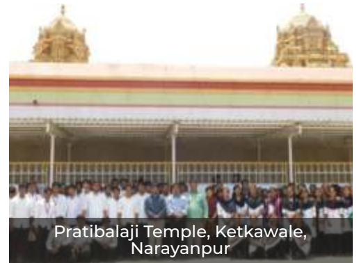
Pratibalaji Temple, Ketkawale, Narayanpur