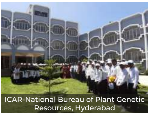
ICAR-National Bureau of Plant Genetic Resources, Hyderabad