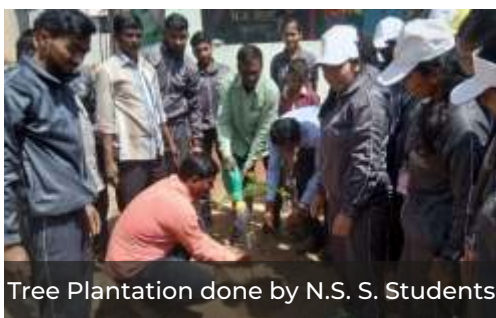
Tree Plantation done by N.S. S. Students