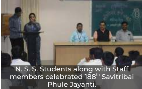
N. S. S. Students along with Staff members celebrated 188 th Savitribai Phule Jayanti.