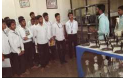
Biofertilizer production unit, Kolhapur