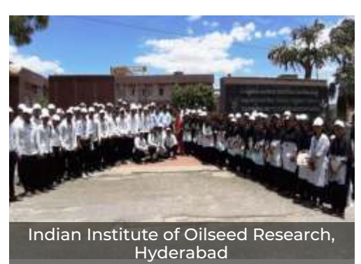
Indian Institute of Oilseed Research, Hyderabad