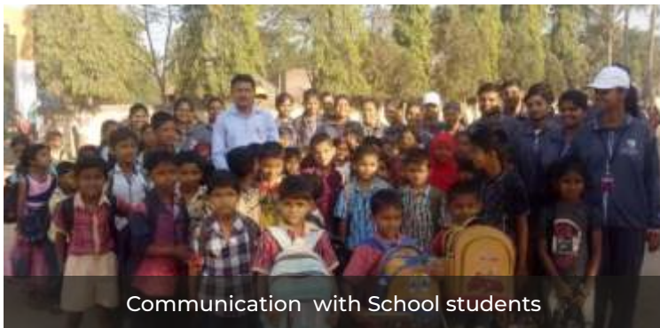
Communication with School students