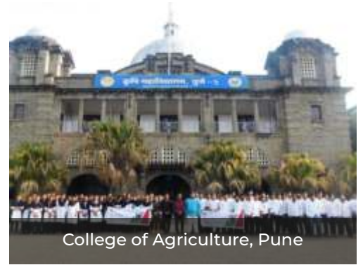
College of Agriculture, Pune