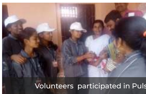
Volunteers participated in Pulse Polio Campaign at Bhendwade