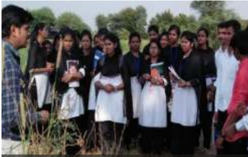
Seed production plot, Toll Plaza, Satara