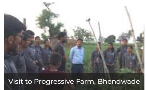
Visit to Progressive Farm, Bhendwade