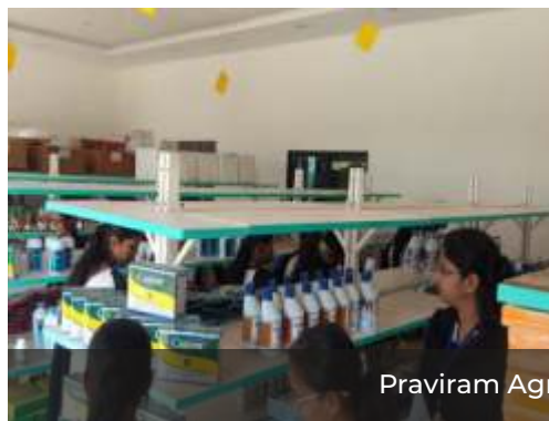
Praviram Agro Mall, Kameri