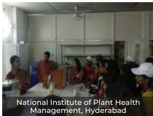
National Institute of Plant Health Management, Hyderabad