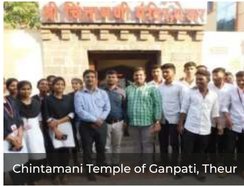
Chintamani Temple of Ganpati, Theur