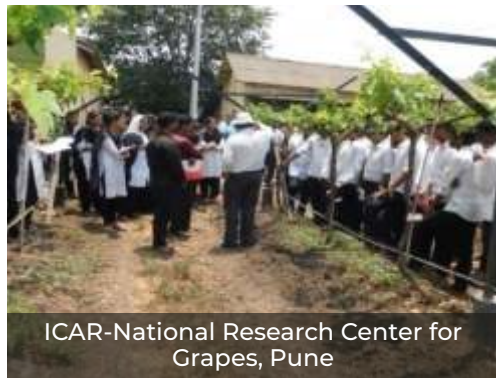
ICAR-National Research Center for Grapes, Pune