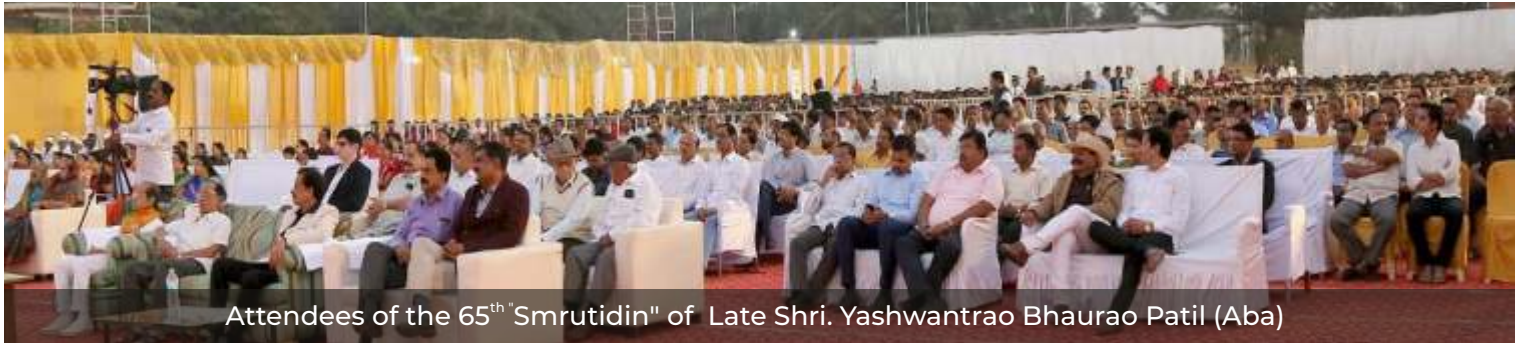
Attendees of the 65 th "Smrutidin" of Late Shri. Yashwantrao Bhaurao Patil (Aba)