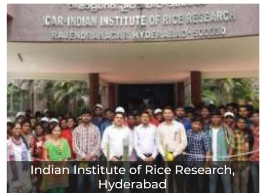
Indian Institute of Rice Research, Hyderabad