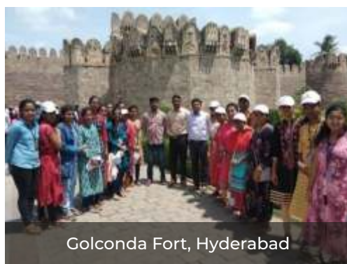
Golconda Fort, Hyderabad